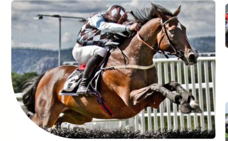
Percussionist (IRE) Sadler's Wells - Magnificient Style

Winner of the Grade 1 American Grand National