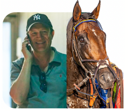
I'm here to assist with your next purchase! Give me a call or send me an e-mail.

Please have a look at my website MBBLOODSTOCK.COM to learn more about my business.